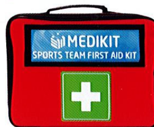
SPORTS TEAM FIRST AID KIT