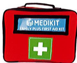
FAMILY PLUS FIRST AID KIT