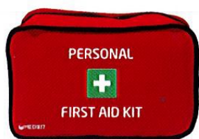
PERSONAL FIRST AID KIT

Order your First Aid kit today online! Special prices for fundraiser, kits priced below RRP http://mymedikit.com.au/mbfa