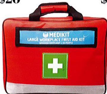
LARGE WORKPLACE FIRST AID KIT