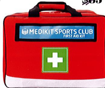
SPORTS CLUB FIRST AID KIT